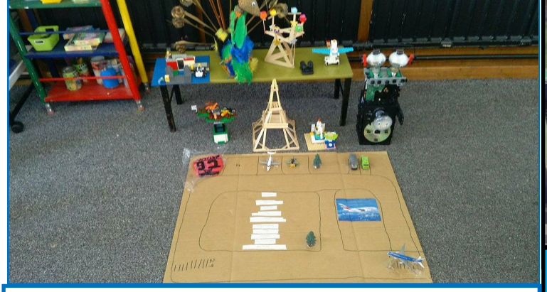
Room 4 Home Learning Sculptures